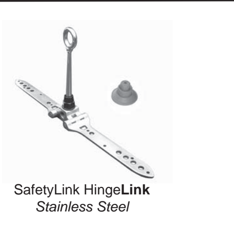
SafetyLink HingeLink Stainless Steel

11 YEARS OF EXTENSIVE TESTING EXPERIENCED TECHNICAL SUPPORT TEAM COMPREHENSIVE INSTALLATION DOCUMENTATION